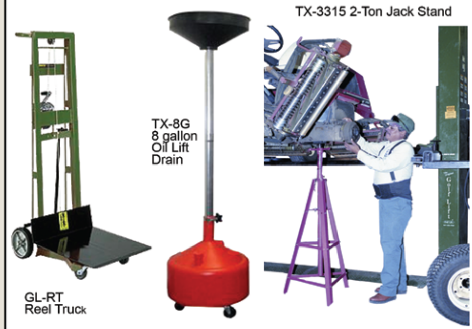
GL-RT Reel Truck