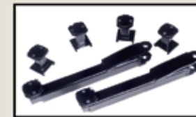
GL-TA Frame/Truck Kit